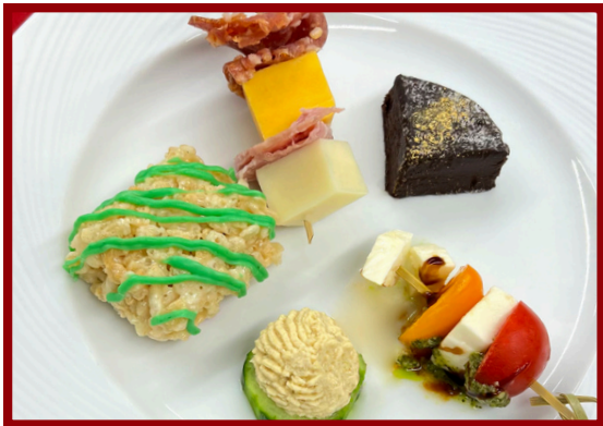
Plate 3: Nutcracker Nibbles Ideal for Gluten-Free Needs

Fruit Skewer (GF/NF/DF/V) Chocolate Dipped Rice Krispy (GF/NF) Charcuterie Skewer (GF/NF) Iced Holiday Cookie (NF) Turkey & Cheese Pinwheel (NF)