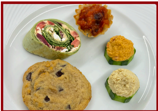
Plate 4: Dewdrop Fairy's Fresh Fare Ideal for Vegetarian/Vegan Needs

Charcuterie Skewer (GF/NF) Chocolate Flourless Cake Bite (GF) *contains coconut Caprese Skewer (GF/NF/V) Cucumber w/ Hummus (GF/NF/DF/V) Chocolate Dipped Rice Krispy (GF/NF)