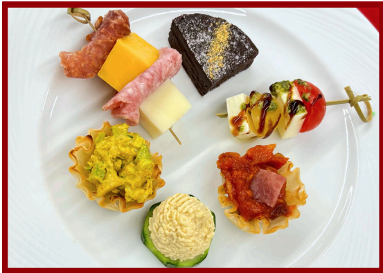
Plate 1: Drosselmeyer's Delights

Charcuterie Skewer (GF/NF) Chocolate Flourless Cake Bite (GF) *contains coconut Caprese Skewer (GF/NF/V) Turkey Bacon & Tomato Jam Puff (DF/NF) Cucumber w/ Hummus (GF/NF/DF/V) Curry Chicken Salad Phyllo Cup (DF/NF)